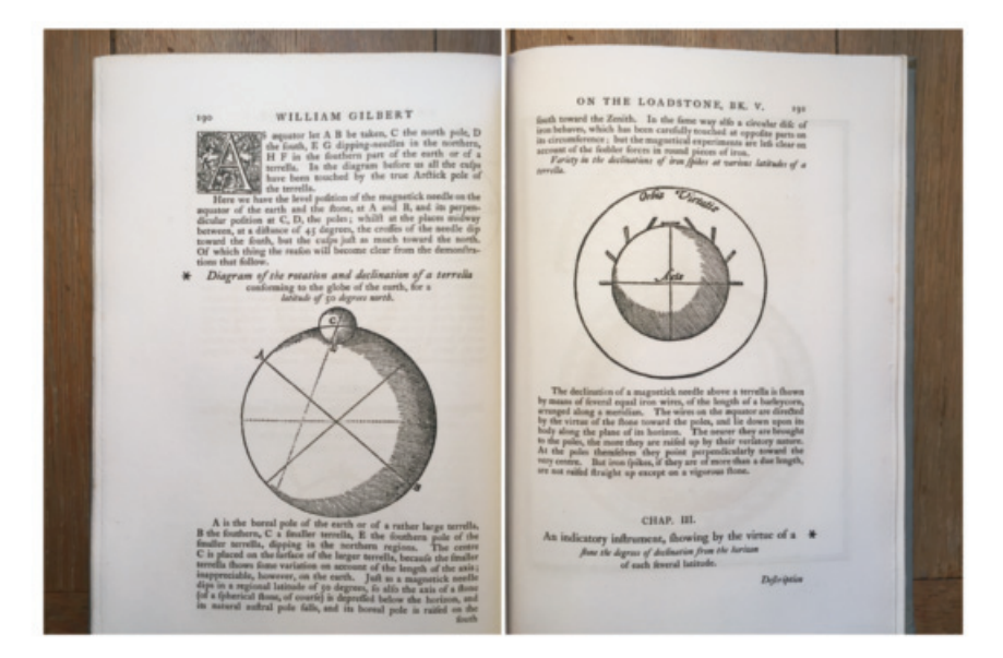
Figure 3 Facing pages from Book V of the 1900, Silvanus Thompson translation of William Gilbert's 1600 text On the magnet, magnetic bodies also, and on the great magnet the earth; a new physiology demonstrated by many arguments and experiment. Complete with reproductions of the author's original drawings, this extract nicely illustrates the spirit of the volume.